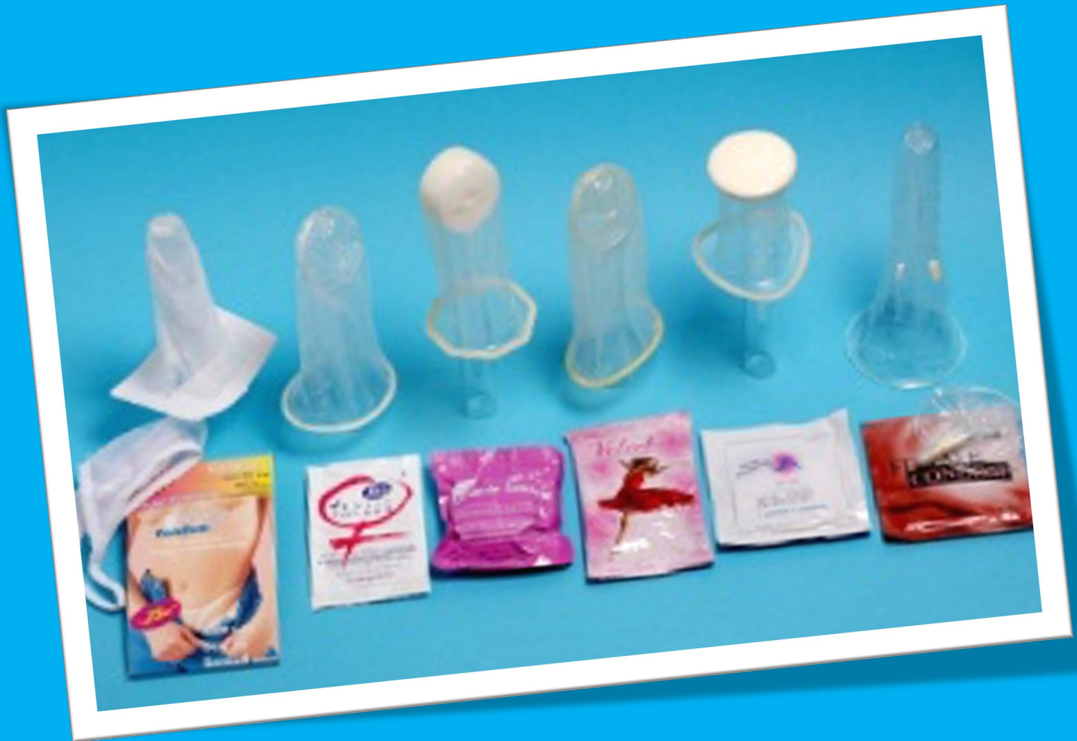
Female (Insertive) Condoms